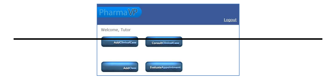
Figure 1. Fragments of the second version of PharmaVP Software : home page and tutors screen.