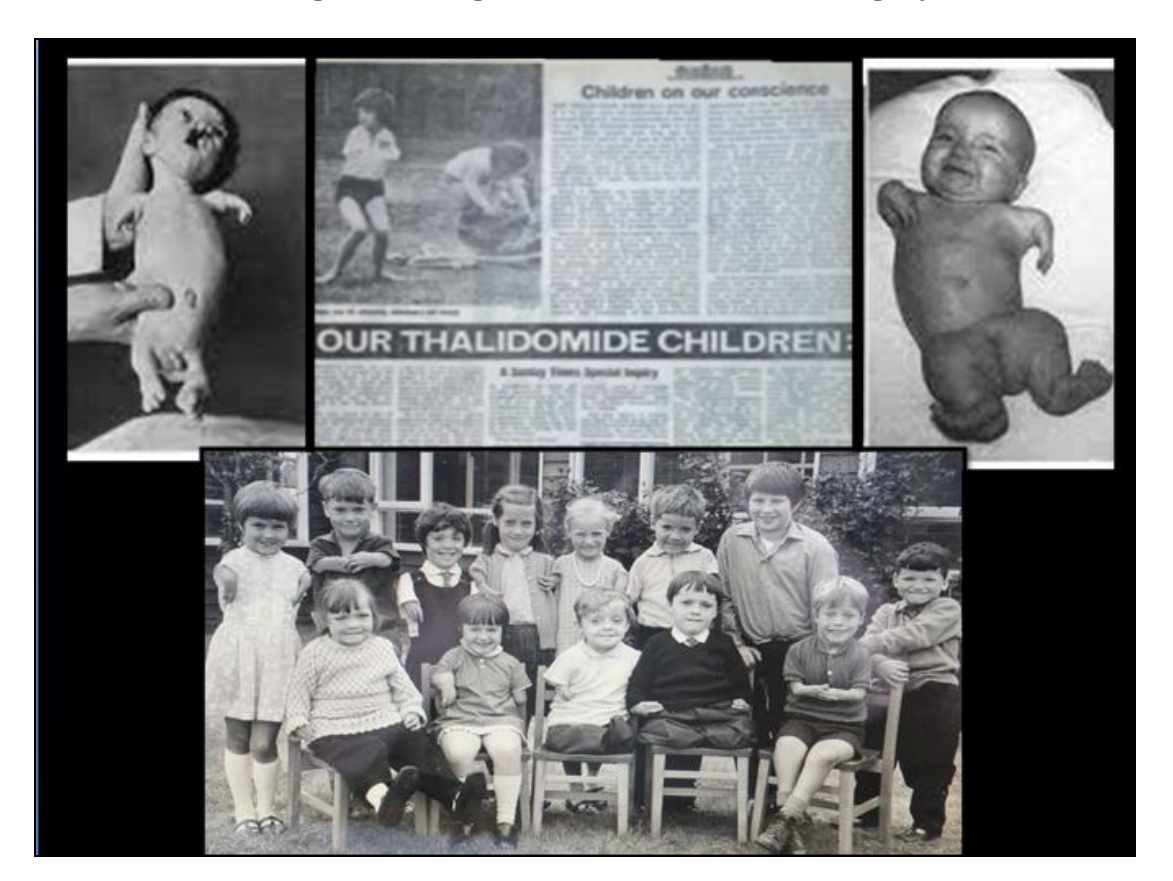
Figure 1: Image related to Thalidomide tragedy