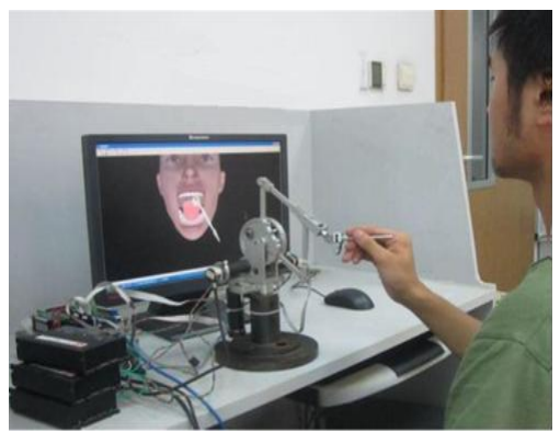
Figure 2- iFeel3 Simulator