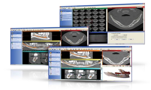
Figure 5- CAD-CAM software