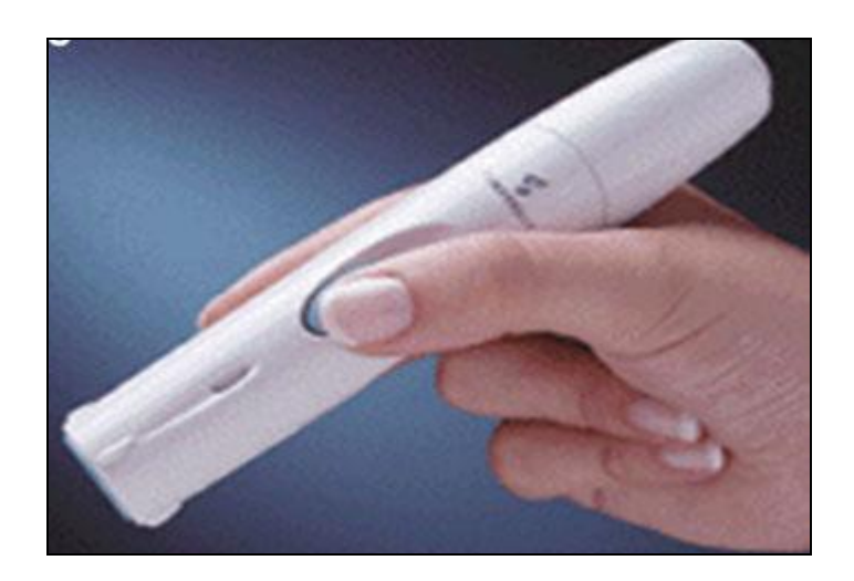
Fig5: Epidermal powder immunization device