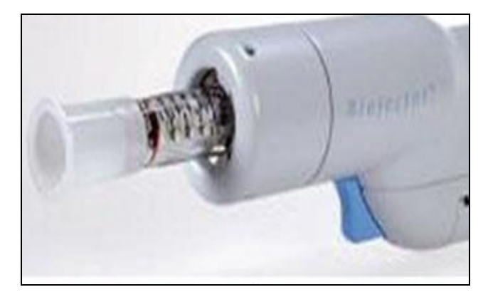
Fig4.1: Jet injector (Biojector 2000) used for investigational purpose.