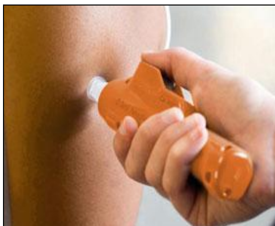
Fig4.2: Jet injector applied to skin for injection