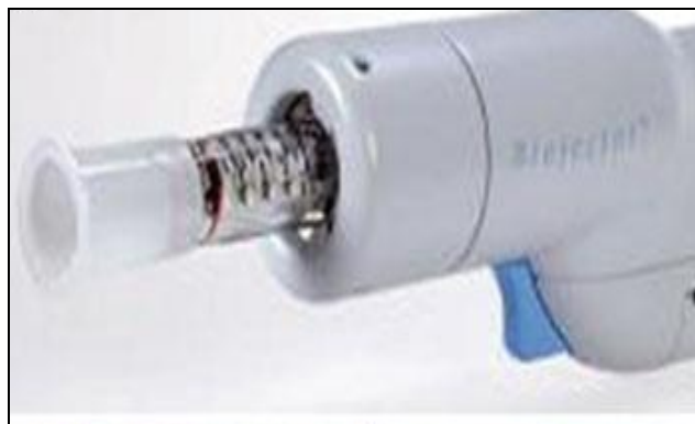
Fig4.1: Jet injector (Biojector 2000) used for investigational purpose.