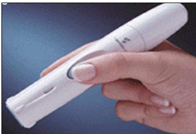
Fig5: Epidermal powder immunization device