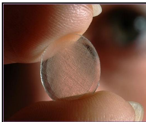
Fig1: Nano patch